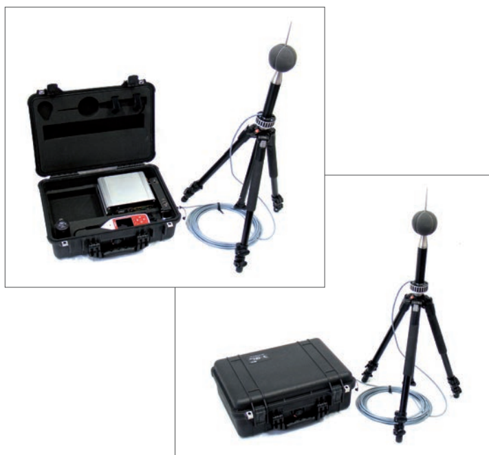
CK:670 Outdoor Kit shown with optional CT:7 Tripod

NoiseTools will display verification symbols if the information matches, a unique feature which will be useful in any legal proceedings.